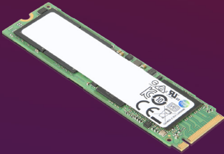
2TB Performance PCIe Gen4 NVMe OPAL2 M.2 2280 SSD