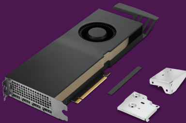
NVIDIA RTX™ A4500 Graphics Card

For a full list of accessories and options, please visit: accsmartfind.lenovo.com