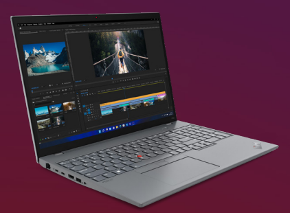
ISV Certifications Certified by many of the leading industry software applications