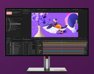
ThinkVision P27h-30 Display