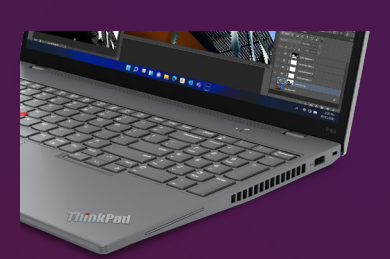
Security The latest security features including dTPM 2.0, an embedded chip dedicated to storing encryption keys