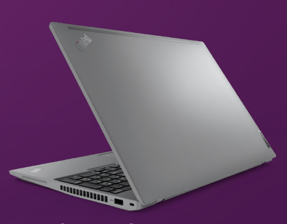
Modern Design Built with sustainable materials and certifications and a choice of Thunder Black or Storm Grey chassis