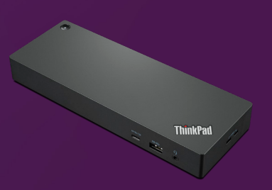
ThinkPad Workstation Thunderbolt™ 4 Dock